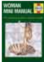
Mini Woman Learn about women and their health