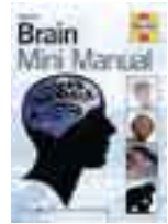
Brain (Mental Health) Coping with stress and how to get help for other mental health problems