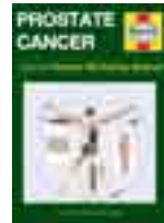
Prostate cancer Advice on the most common male cancer