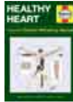
Healthy heart Straightforward advice on heart health