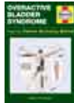
OAB (Overactive Bladder) Advice on how to manage an overactive bladder