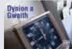
Dynion a Gwaith Sut i reoli problemau iechyd yn y gwaith sy'n effeithio ar waith