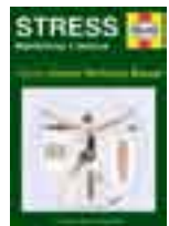
Stress How stress can affect your life and how to reduce its effects