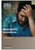
Domestic violence Not only by men, but also towards them. Advice on what to do and where to get help.