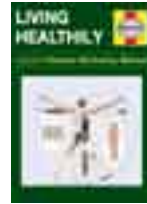
Living Healthily Practical advice on diet, lifestyle and exercise