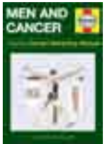
Men and cancer Taking the stigma out of cancer and what you can do to help prevent it