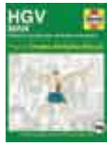
HGV Manual Full size manual filled with information for weight loss and healthy living