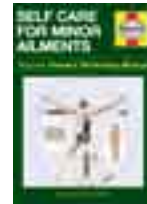
Self-care How to quickly and effectively manage your own health