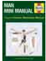
Mini Man Practical help for many male health problems