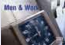
Men & Work How to manage health problems at work that affect work