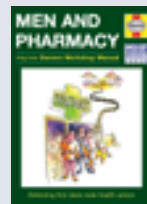
Men and pharmacy How to get the best out of pharmacy services