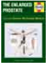
BPH (Benign Prostatic Hyperplasia) What every man needs to know about their prostate and prostate testing