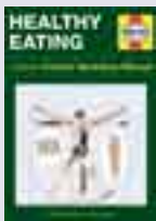
Healthy eating Advice on eating for pleasure and health