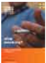
Stop smoking Smoking cessation advice which could add years to your life and improve your health