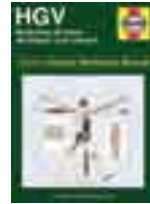
HGV (Weight Control) Help on how to lose the weight and feel great